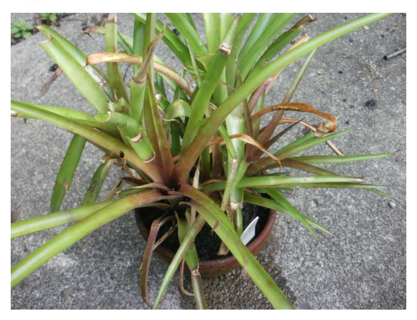
What did you discover in your garden this summer? We'd really like to know. Please share!

Reclaiming a battered plant: I had two small pots of Aechmea 'Suenos' which had suffered through several periods of drought and looked pretty wretched. I placed them in a pan which soon filled with water from a rain storm. I watched them carefully and saw no sign that they resented sitting in 1 1/2" of water. On the contrary they flourished and with our freakish weather this year the pans stayed full of water the whole summer. New pups proliferated and the older ones are large and well colored.