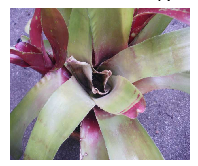
Neoregelia 'Gespacho' ca. 3 months after blooming (photos taken at same time and place)

I had a hunch that to get the best color and markings in Neoregelia 'Gespacho' the pups need to be given strong light from the time of their emergence. This summer I had the chance to test that hypothesis. I had a pup from a mother which had been grown in partial sun and a pup from a plant at Matthaei Botanical Gardens which grew under shade cloth. The mother plants of both pups came from the same original plant. Both pups were almost exactly the same age. The Matthaei pup, grown in less light and having been modestly fertilized, was half again as large as my pup, grown hard (i.e. in strong light without fertilizer). Both plants bloomed at approximately the same time. My plant was (of course!) much more striking in appearance. What intrigues me now is that the plant grown hard remains in good color for some time after blooming whereas the one grown under less light has faded out.